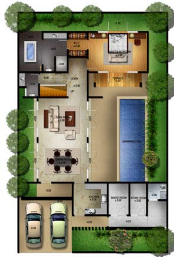
FIRST STOREY PLAN