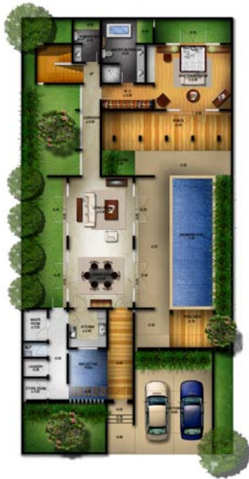
FIRST STOREY PLAN