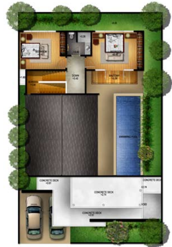
SECOND STOREY PLAN