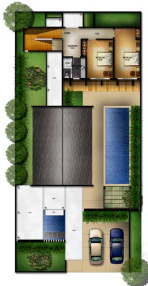
SECOND STOREY PLAN