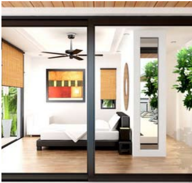
4 bedrooms with en suite bathroom

The residents of El Cid Mountaintop Estates will share a dream lifestyle of hazy sun-shine ambience and otherworldly natural beauty, in secure and private villas built to the highest international standards.