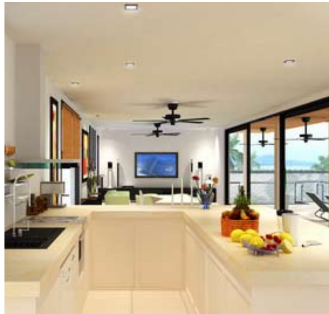
Open plan kitchen/dining/living area