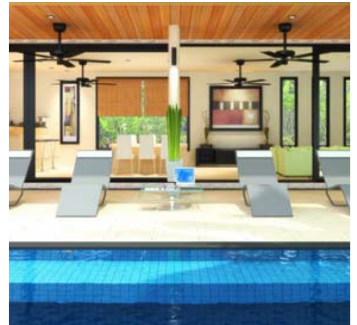
Tropical indoor-outdoor living