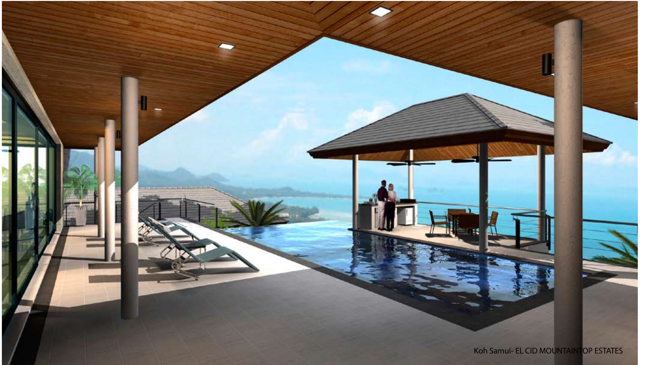
Koh Samui- EL CID MOUNTAINTOP ESTATES